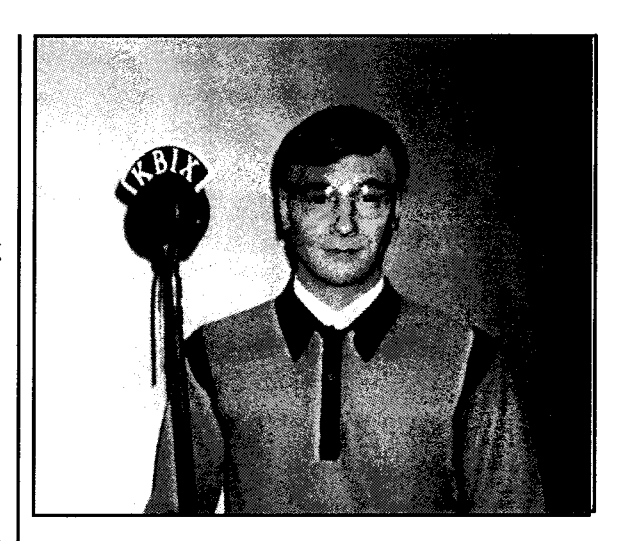
Three museum-quality mannequins, like this "1940s D.J." will bring the museum exhibits to life.

Visitors will enjoy the "Gone, But Not Forgotten" exhibit which takes a look at many old landmarks from around the Three Rivers Region that have been lost to time and progress.