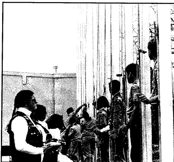
Local Scout Troops assist in raising the Fourteen Flags of the Three Rivers Region