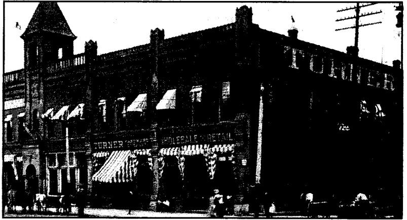
The Turner Opera House, above Turner Hardware, was located at Main and Broadway in Muskogee.

grand scheme for seating 700. The upper seating was hemispheric in shape, extending 20 to 30 feet from the back of the first floor room. Two boxes along each wall were located on the leading edge of the parquet. The main body of seats was located on the floor of the theater. This area included about 3,000 square feet from the orchestra pit to the back wall.