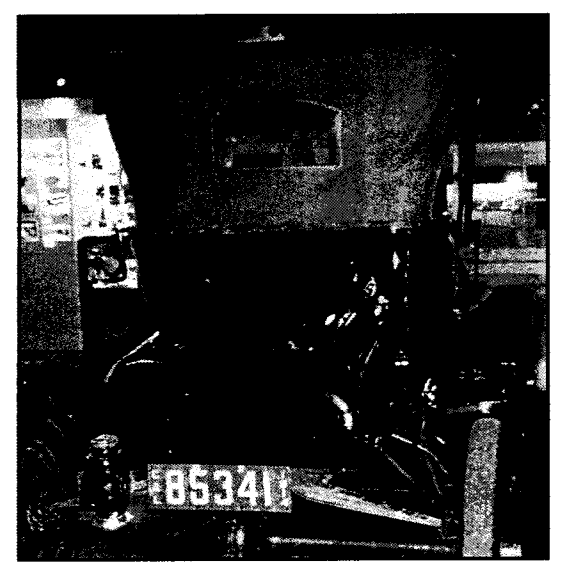
The 1914 California license plate