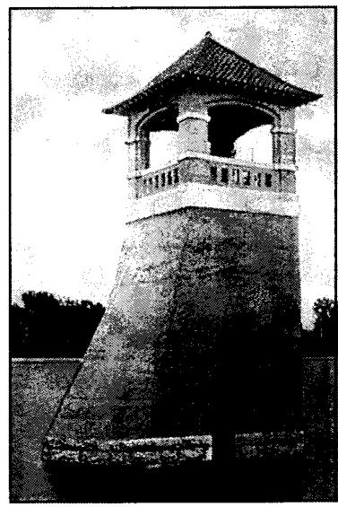
The pumping station on the Grand River

Hinckley's skills in surveying and civil engineering prompted his selection to work on building a city-wide water