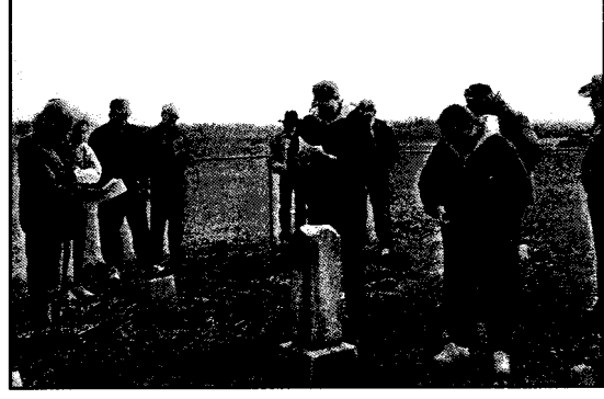
The group studies information on the Griffin Cemetery near Webber's Falls