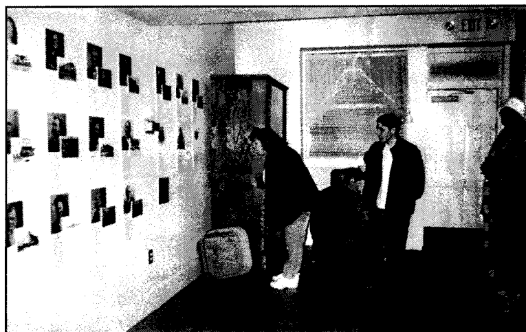
Parade goers stop by the museum and enjoy the exhibits

Across the street at the Frisco Freight Depot, the Oklahoma Music Hall of