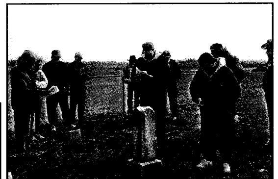
The group studies information on the Griffin Cemetery near Webber's Falls