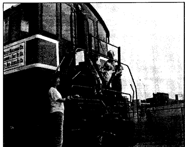
Visitors to the Three Rivers Museum this summer enjoyed climbing aboard our vintage engine.

To be entered in the drawing for these prizes, the children had to complete a Scavenger Hunt by answering three questions about each museum. The answers to the questions could be found among the museum's exhibits.