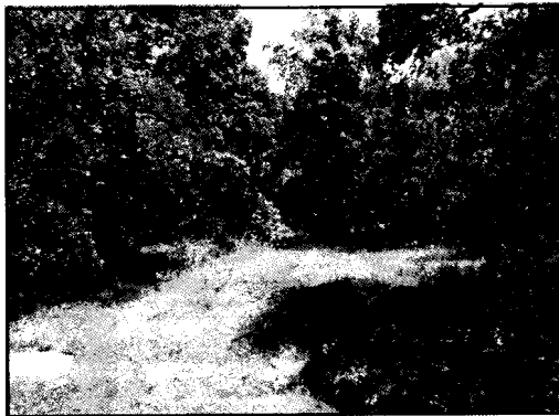
Remnants of the old Texas Road still run through the Honey Springs Battlefield site.

In June, the museum hosted a Caravan Tour to the Civil War battlefield known as Honey Springs. We walked the trails of the site where the Union troops defeated a larger Confederate force. We also visited two cemeteries and stopped at a Confederate lookout spot called Chimney Mountain.